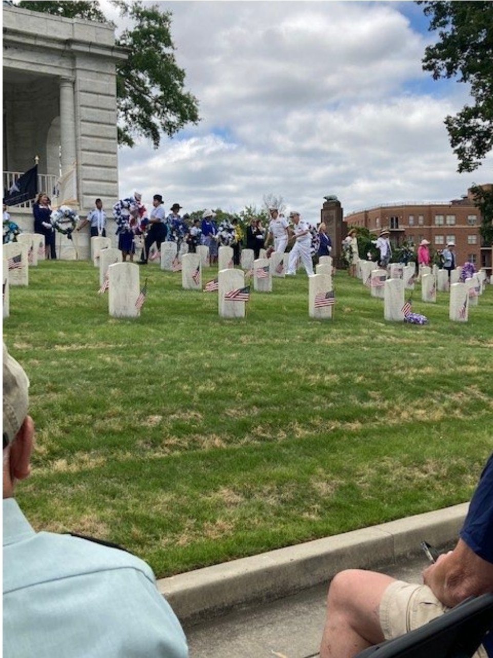
Wreaths are laid on May 29,2023 at the Memorial Day Ceremonies at the Marietta National Cemetery.