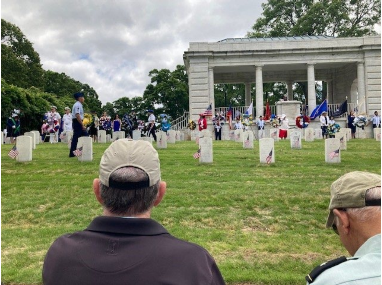
Wreaths are laid at the Memorial Day Ceremonies held on May 29, 2023 at the Marietta National Cemetery.

Every year the Atlanta Metropolitan Council participates in the Memorial Day Wreath Laying ceremonies at the Marietta National Cemetery. This event is put on by the National Memorial Day Association and this year was held on May 29, 2023.